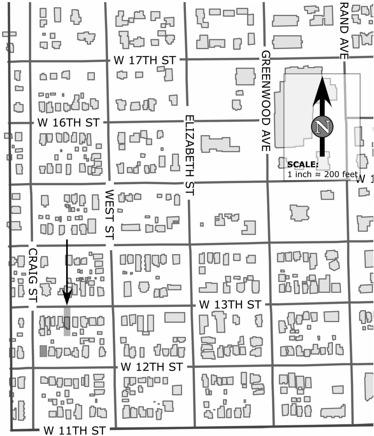
SITE SKETCH MAP