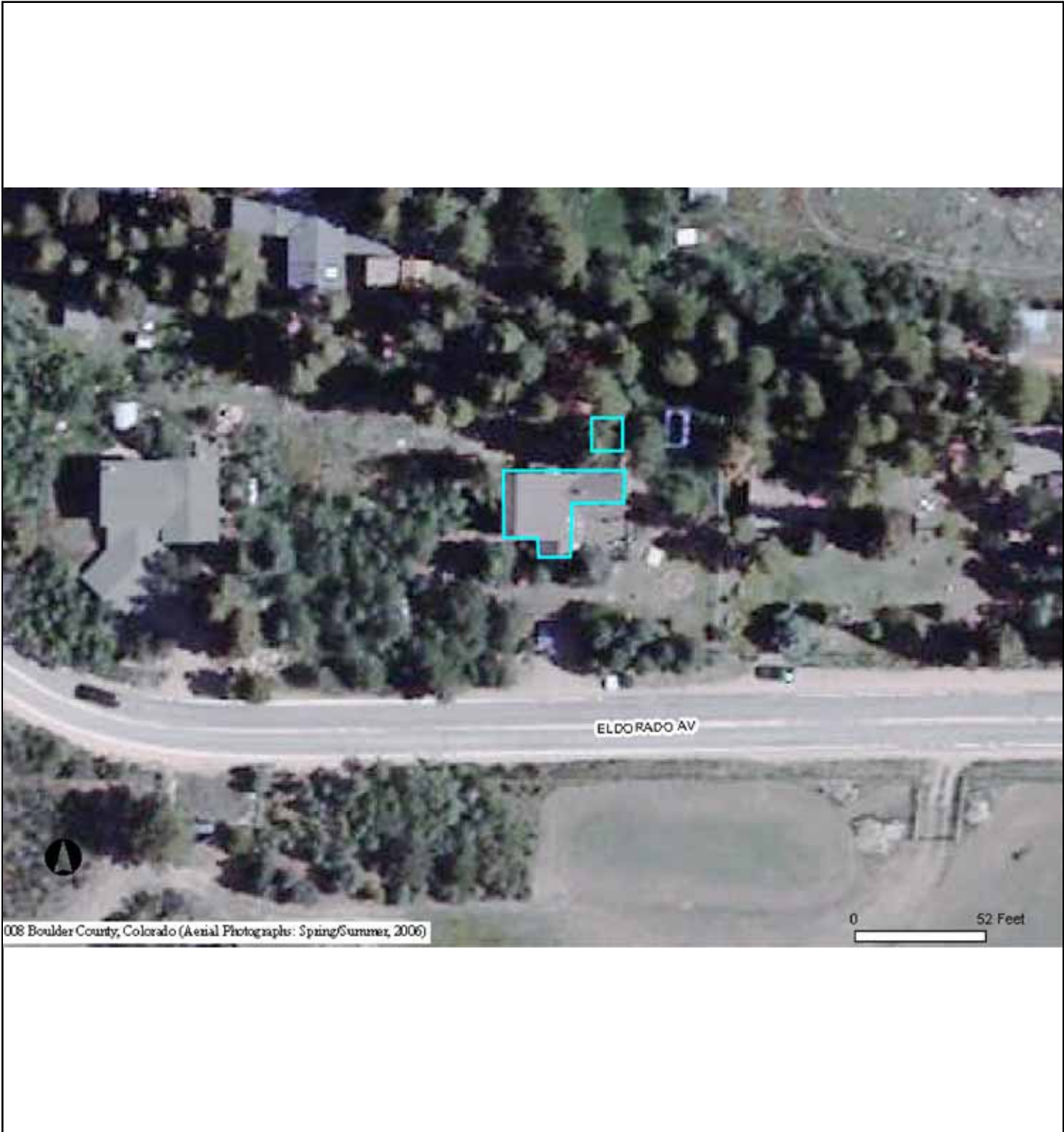
008 Boulder County, Colorado (Aerial Photographs: Spring/Summer, 2006)