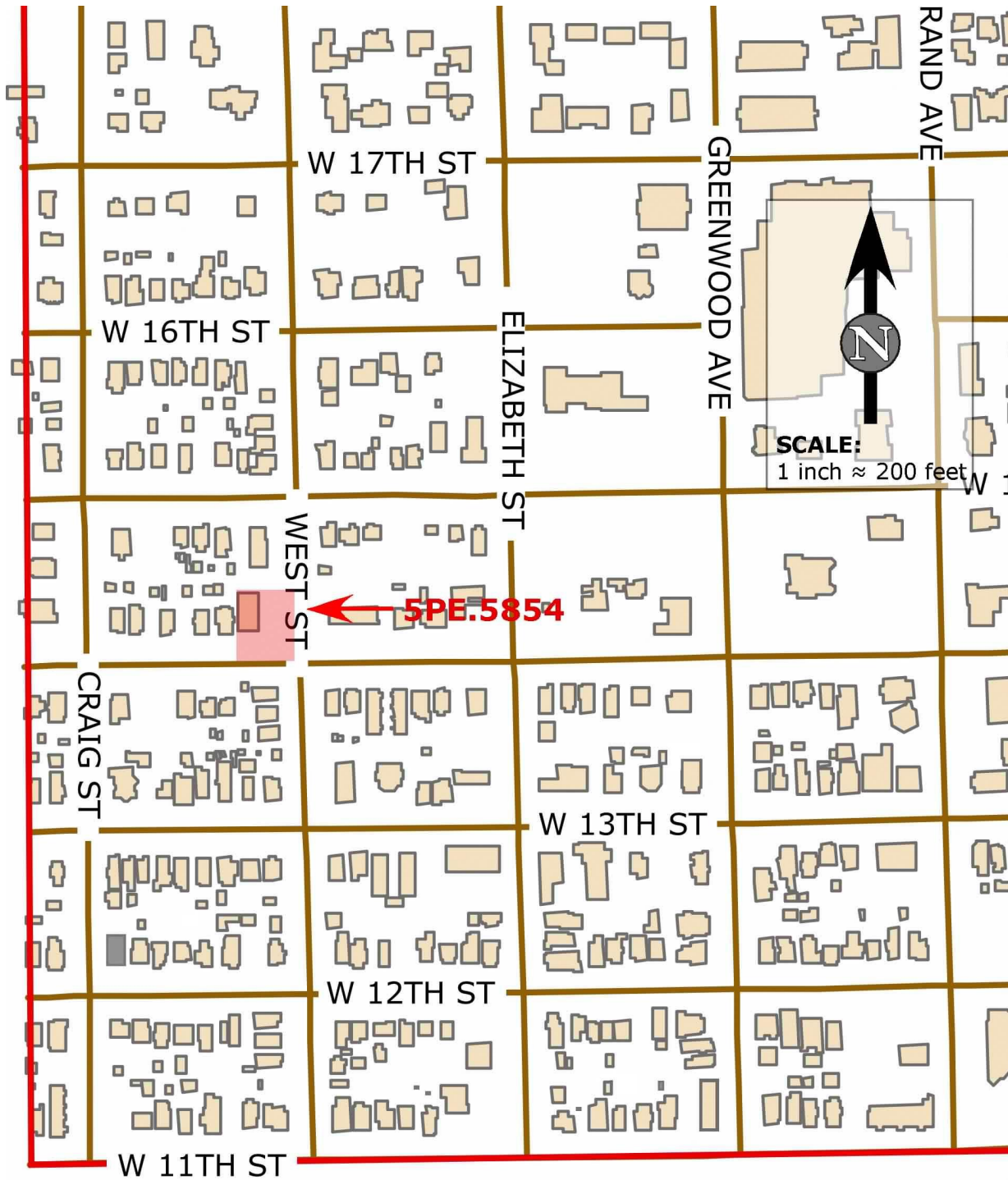
SITE SKETCH MAP