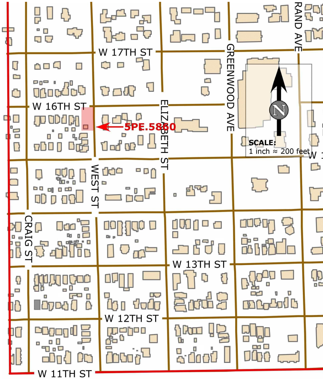
SITE SKETCH MAP